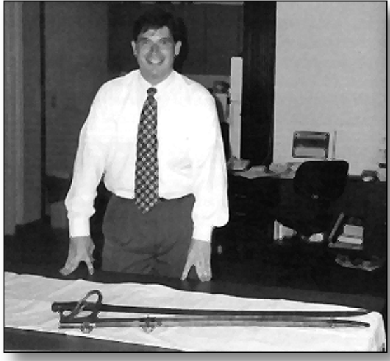
The author with the McKay Sword