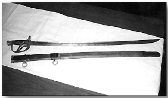
The McKay Sword, Gamble Plantation State Historic Site

The Times writer added another detail to back the McKay side of the argument.