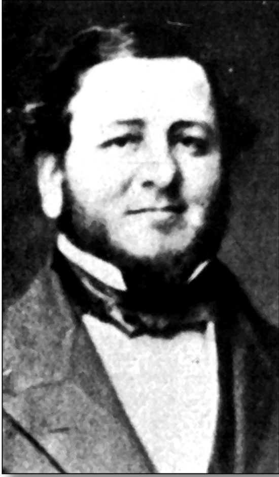
Judah P. Benjamin